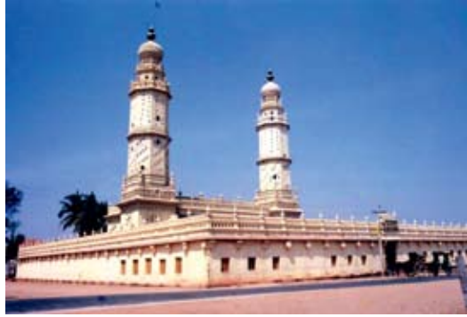
Juma Masjid (Masjid-E-Ala), Srirangapatna

Islam: Islam entered Karnataka soon after its propagation in Arabia as Arabs were trading at the ports of Karnataka. Some of the Arabs had settled on the West Coast and inscriptions speak of them as Tadjikas. As testified by Sanjan plates, the Rashtrakutas had a Tajjika Governor and Arab travellers also speak of Muslim settlement in the major commercial centres of Rashtrakuta empire. Their guild called Hanjamana (Anjuman) is mentioned in the records of the Kadambas of Goa, Alupas of Dakshina Kannada and of Vijayanagara. The Navayats and the Mapilles (Moplas) are the Muslims from Karnataka Coast, who follow the Shafi sect like the Arabs. The Afghan, Turks, Persians etc. are called Dakhni Muslims, who speak Urdu and belong to Hanafi sect. Islam introduced the Persian and the Arabic languages into Karnataka and Dakhni Urdu also developed in the South. Fine Indo-Sarsenic monuments at Gulbarga, Bidar, Bijapur, Shahpur, Sagara, Gogi, Ashttur, Sira and Srirangapatna have the pride of place in the history of Islamic art of Karnataka. The Sufi sect is also popular in Karnataka and the tomb of Bande Nawaz Gesu Daravaz at Gulbarga is highly venerated by all. The Sufi saints received royal patronage from Bahmani rulers and they were active at Gulbarga, Bidar and Bijapur. The Muslims introduced coffee, paper and agarbatti (joss stick) industry into Karnataka. Tipu introduced sericulture.