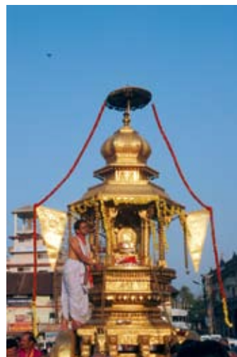
Gold Chariot, Udupi

Jatras: Every year, the Jatras (fairs) are held in honour of village dieties (grama devathas) generally after the harvest takes place. In Hindu temples, Muslim dargahs, Jain bastis and in other holy places of worship people celebrate annual festivals. Men, women, people of rural and urban areas take part in these jatras with full enthusiasm without discrimination of caste, creed and religion. Itinerary merchants open their stalls to sell toys, sweets, sarees, vessels, bangles and other items during these jatras. Cattle fairs are also held in many places during the jatras and these are the centres of large trade and commerce. Jatras promote social and religious harmony among various sections of the society.