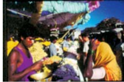
A Jatra Scene

The Hindus have several religious holy days, occasions of festivals and fasts throughout the year. Some of the important festivals for Hindus are: New Year Day or Ugadi (the first day of Chaitra month); Ramanavami (the birth day of Lord Rama, the ninth day of Chaitra); Basava Jayanthi the birth day of Basaweshwara (Akshayatriya); Shankara Jayanthi the birth