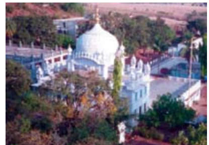
Guru Nanak Jhira, Bidar

Sikhism: Sikhism also has left Its Imprint on Karnataka. Guru Nanak is believed to have visited Bidar and there is Guru Nanak Jhira Sahib in his memory. One of the close disciples (Panch Piyares) of Guru Govind, Bhal Sahib Chand (later known as Sahib Singh), a barber, was from Bidar and he was among the five who were initiated to the Khalsa. Considerable number of Sikhs took service under Hyder and Tipu and many have come and settled down in the cities of