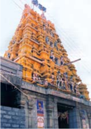
Narasimha Temple, Ganagapur

Dasimayya and Ekantada Ramayya, two saints who had preceded Basava and contemporaries of Basava like Allama Prabhu, Channabasava, Siddarama, Madivala Machayya (a washerman), Kakkayya (a cobbler), Hadapada Appanna (a barber) and women like Akka Mahadevi, Akka Nagamma, Neelambika Mukhtayakka and others were among those who composed Vachanas and profounded this philosophy. The Veerashaivas are a major section and are recognised by the Ishtalinga which they wear on their body. The practice of 'dasoha' led to the starting of free hostels by the Veerashaiva Mathas and in the long run to educational institutions. The Veerashaivas are rendering yeoman service in the field of education in the state.