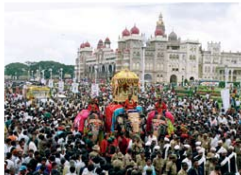
Dasara Procession, Mysore

In many places, Navarathri is also celebrated as Nada Habba (State festival) and in Mysore, on Vijayadashami day (the victorious tenth day), the statue of Goddess Chamundeshvari is taken in a colourful procession to Bannimantapa with all pomp and pageantry, consisting of tableaux of historical episodes, infantry, mounted horses, Bharat Scouts and Girl Guides, NCC., Bharat Seva Dal etc. Rama Navami and Ganesh Chaturthi are marked by public celebrations accompanied by speeches, dance and music recitals. Kodavas have three important festivals like Koil Muhurta, Cauvery Sankramana and Huthri (harvest festival).