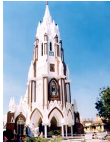
St. Mary's Basilica, Bangalore

Christianity: With the advent of the Portugese, Catholic Christians entered Karnataka. Portugese founded factories at Mangalore, Kundapura and Honavar where they also tried to secure converts to their religion in the days of Vijayanagara. Inquisition, epidemic and famines forced many Catholic Christians to leave Goa and enter Karnataka. Keladi rulers encouraged their migration as the Christians had acquired new techniques in agriculture and animal husbandry. Keladi Channamma granted a site to them to build a church at Mangalore. During the beginning of the 19th century, Protestant missionaries like the Basel Mission, the London Mission and the Wesleyan Mission entered Karnataka. The